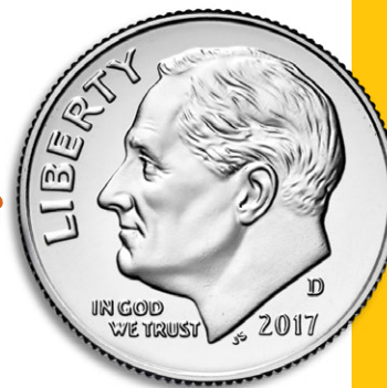
Dime enlarged to show detail.

DURYSTA™ is smaller than the “I” in LIBERTY on a dime!